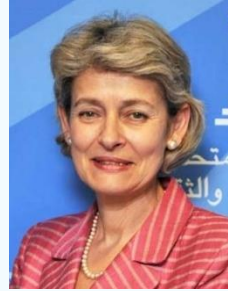
Dr. Irina Bokova Former Director General UNESCO